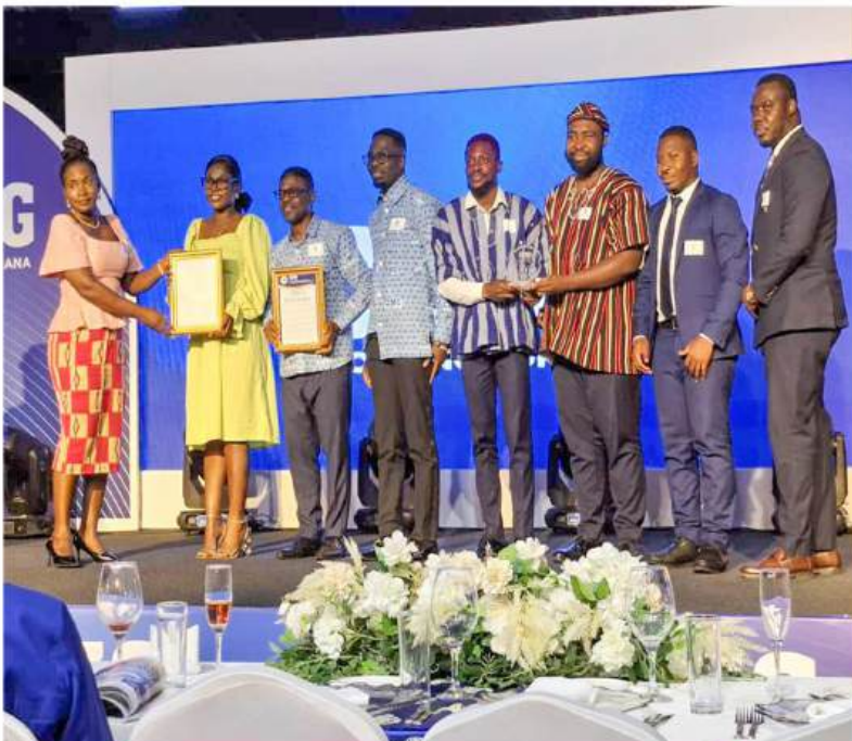
Officials of NCHS receiving the 2024 CIMG Private Health Facility Award

New Crystal Health Services, which has been in existence for the past 22 years, is undoubtedly one of Ghana's most outstanding private healthcare facilities which keeps growing and expanding each passing day.